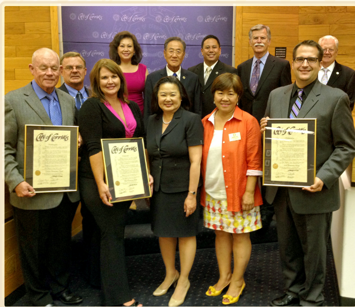
Cerritos City Council Honors the 2014 California Distinguished Schools- Cerritos ES, Elliott ES, and Leal ES.