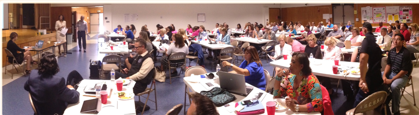
Thanks to the ABCFT and the entire ABC Academic Services Team for a successful day of working in partnership for the good of our schools and students!

A joint meeting with principals and site union representatives was held at Cabrillo Lane on August 26 to focus on some of the major new initiatives this year. The theme was “Partnership Advance—Working Together to Lead Change.” This was a collaborative effort with Academic Services and ABCFT to look at the implementation of the Common Core State Standards, Local Control Accountability Plan, and State Assessment. ▶