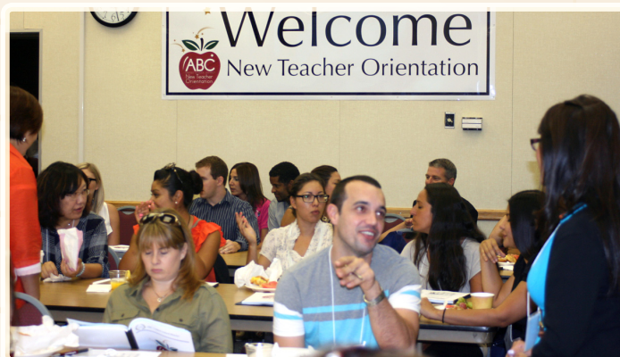
The District welcomes over 50 teachers to the New Teacher Orientation. Welcome to a new school year!

ABC's new teachers are enthusiastic and committed to student achievement! ▶