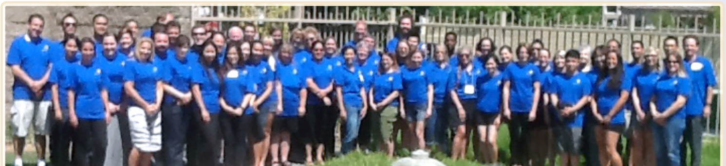
ABC Secondary Science teachers were trained in STEM (Science Technology Engineering Math) at Whitney HS in August.

During the week of July 28 - August 1, 54 secondary science teachers attended the STEM (Science, Technology, Engineering, Math) grant training at Whitney High School. A major focus of the training was on the embedding of engineering practices into the teaching of science content based on the Next Generation of Science Standards (NGSS). These training sessions were conducted by teaching triads called cadres. Each cadre was composed of a high school science teacher and two CSULB faculty members with one from the engineering department. ▶