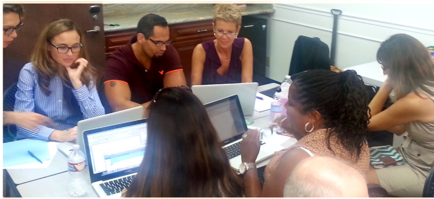
Secondary school site managers created their Family Connection homepages through Naviance.

Academic Services is pleased to support all middle and high schools this year in implementing the Naviance program. Naviance is a web-based program that provides middle and high school students with tools to improve college and career planning. Students' being able to plan for college and career beginning in middle school in order to be best prepared for making important college and career choices in high school is vital to their success. This is also part of our LCAP goal 7.2; increase readiness for college and careers. ▶