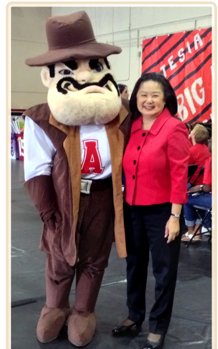
Go Big Go Red Rally at Artesia High School