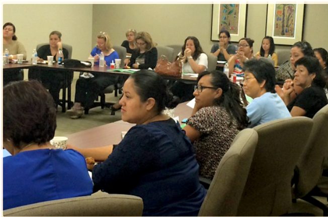
Head Start and State Preschool/LAUP Professional Development held at the LACOE Santa Fe Springs Resource Center.

In the spirit of collaboration, Head Start and State Preschool/LAUP teaching staff held the first professional development of the year at LACOE Santa Fe Springs Resource Center. Utilizing both our own highly trained staff as well as LACOE consultant staff, our teachers and para educators spent a day deepening their knowledge of the new Creative Curriculum and effective implementation of Early Childhood Education instructional strategies. As part of the RTI (Response to Intervention) in the preschool setting, teachers also received practical training on the elements of Second Step, the intervention curriculum implemented by ABC Child Development programs. This day of collaboration was topped off with LACOE staff providing a tour of their newly enhanced Resource Library. The library space and resources are available to our staff and parents free of charge and several teachers enthusiastically took advantage directly following the training. ▶